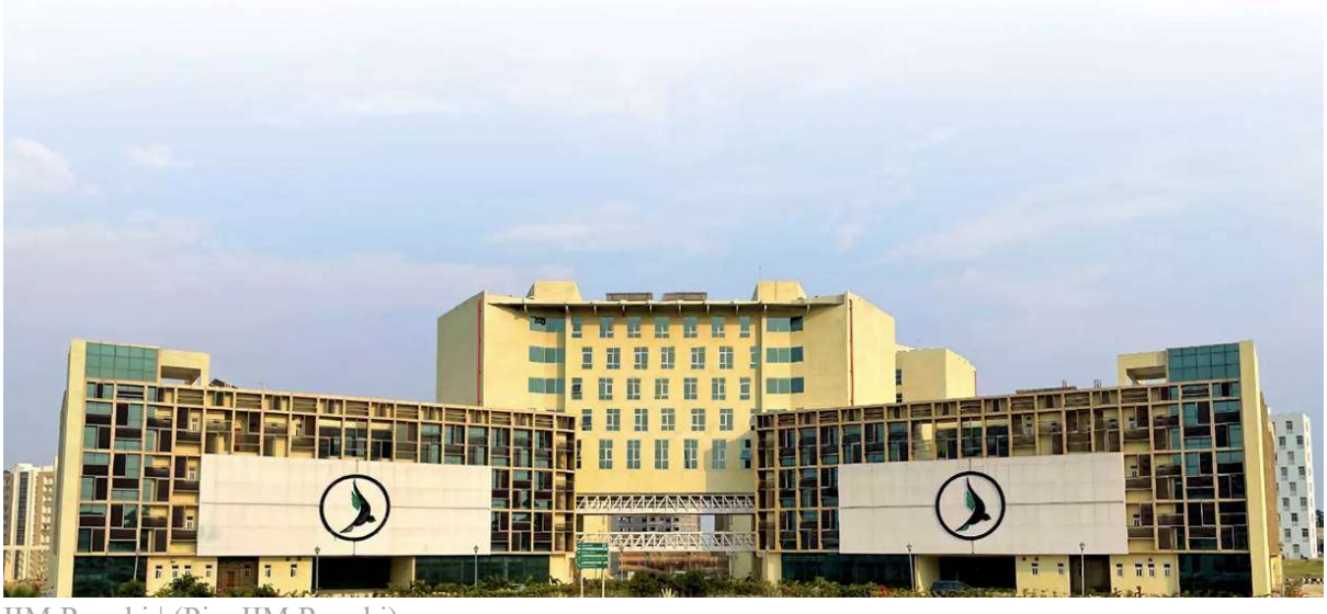
IIM Ranchi

This platform offers attendees the opportunity to delve into the intricacies of happiness, with the ultimate goal of developing strategies to enhance both individual and societal happiness