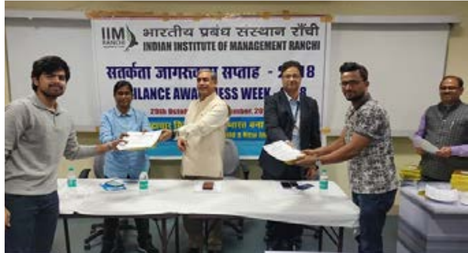
Closing ceremony, IIM Ranchi, 02.11.2018