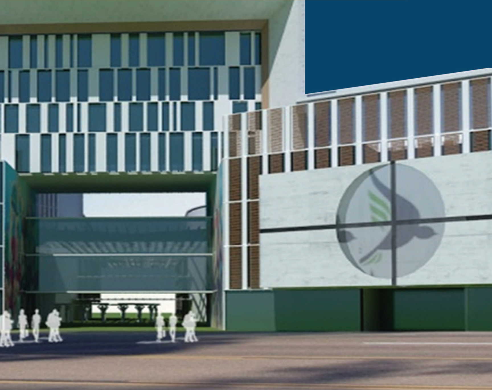
Front view of Academic Block at our upcoming campus