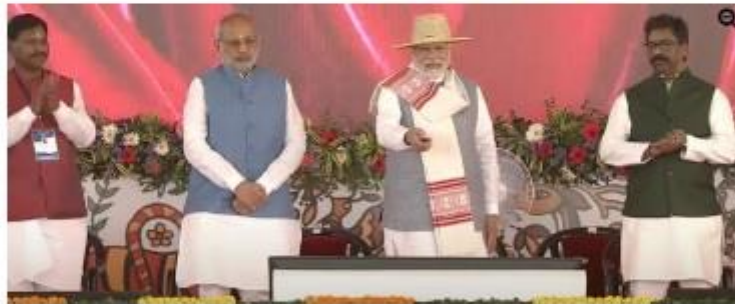
During campus inauguration

The Indian Institute of Management (IIM) Ranchi was inaugurated by Prime Minister, Shri Narendra Modi on November 15, Wednesday.