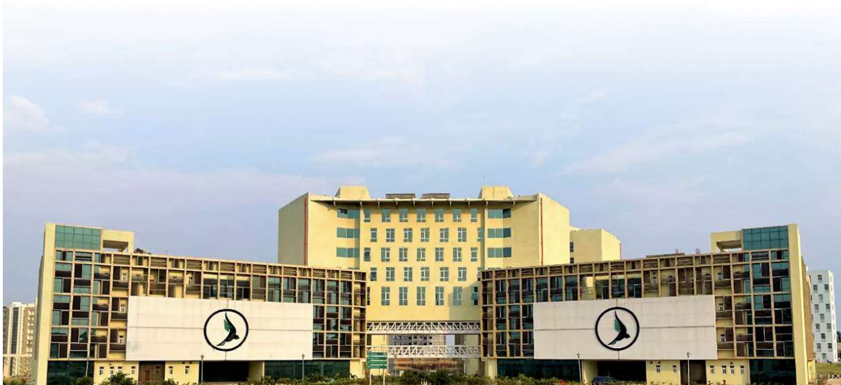
IIM Ranchi | (Pic: IIM Ranchi)

This platform offers attendees the opportunity to delve into the intricacies of happiness, with the ultimate goal of developing strategies to enhance both individual and societal happiness