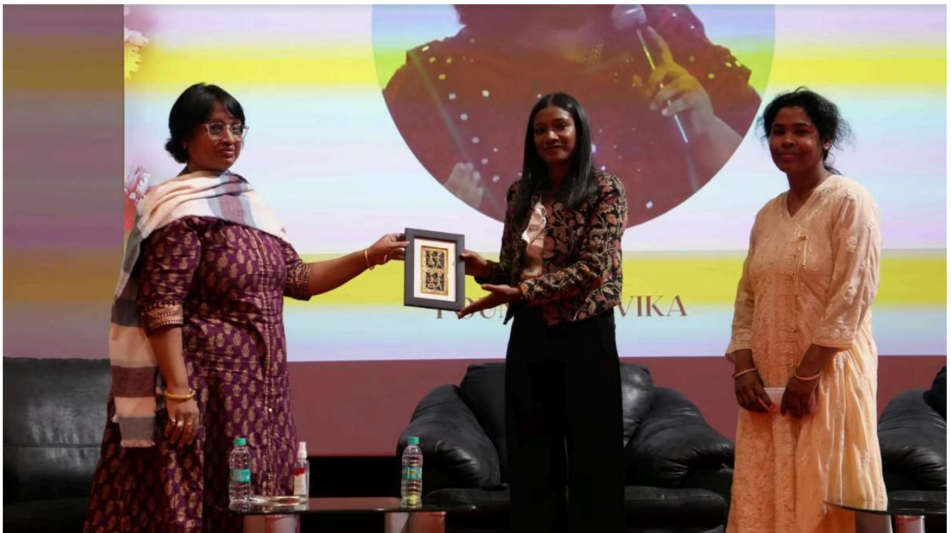
During the event

The institute's commitment to diversity and inclusion is evident in its initiatives