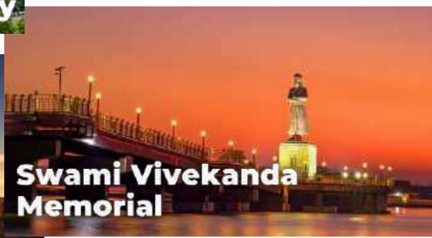
Swami Vivekanda Memorial