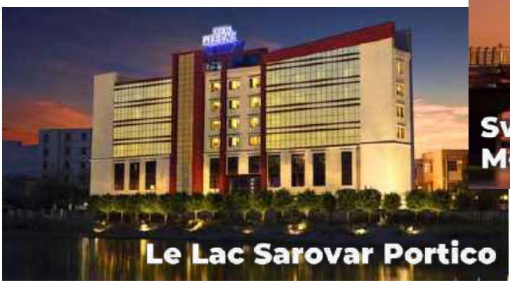
Le Lac Sarovar Portico