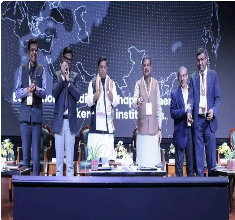
Pradhan launches Bodhan AI Centre; IIT Bombay to set up research hub, IIM Lucknow, Ranchi, Jammu introduce courses

IIM Ranchi unveiled a Centre for Teaching with AI; IIM Jammu-AIT Bangkok, a dual-degree MBA in AI and Business Analytics; and IIM Lucknow, new UG and PG AI programmes at Bharat Bodhan AI Conclave