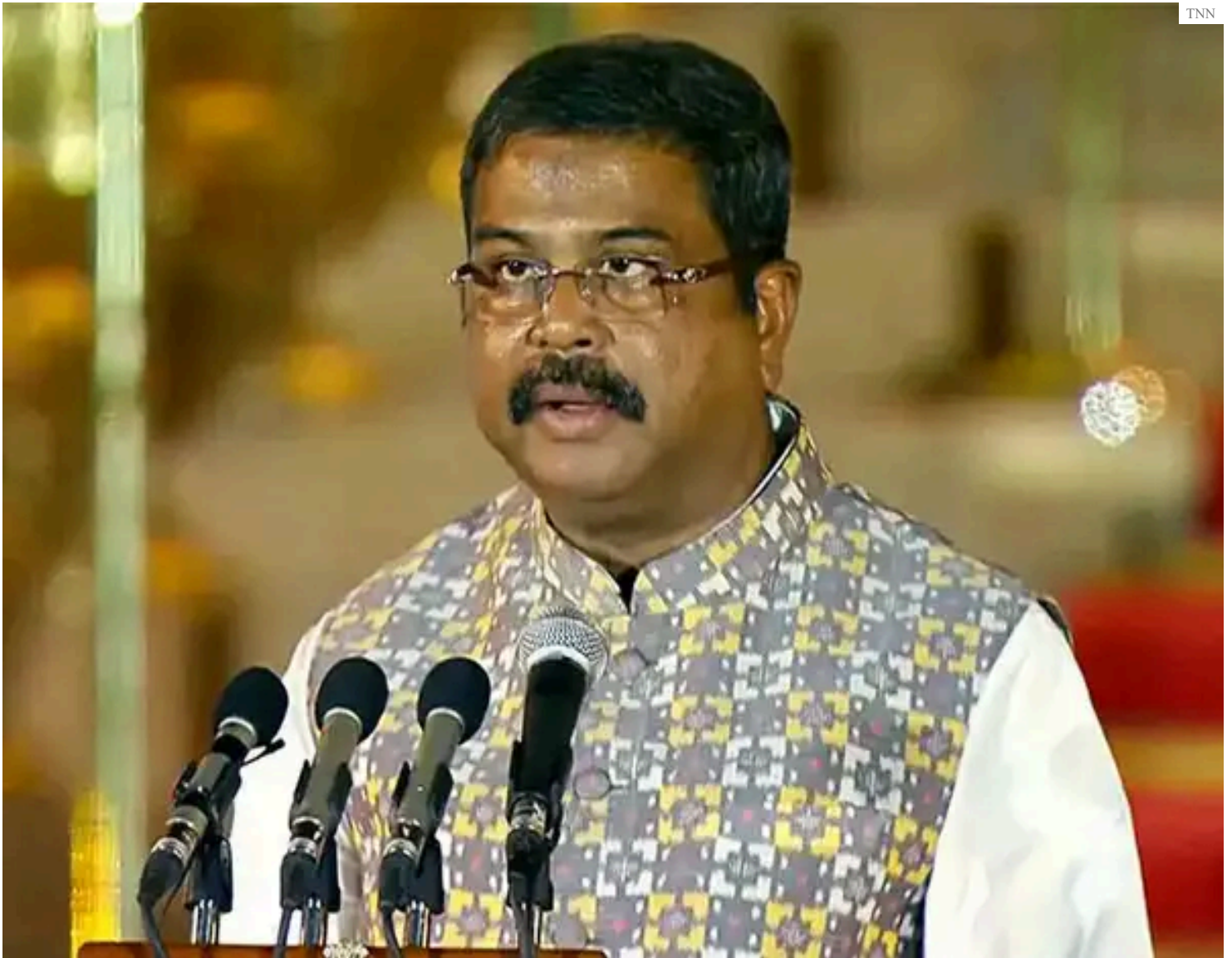
Union Education Minister Dharmendra Pradhan.