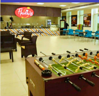
CAFETERIA & DINING