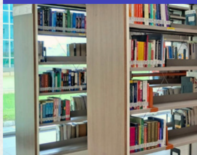
LEARNING RESOURCE CENTRE